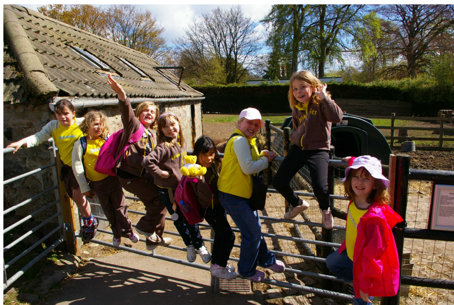
Brownies at Hazelhead during their visit to Aberdeen.