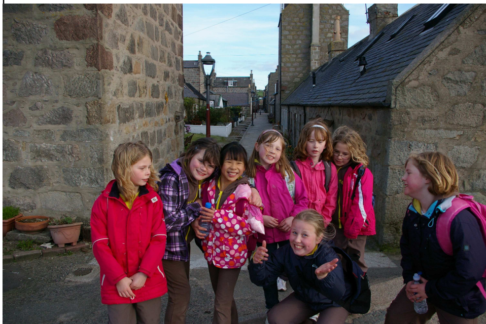
Brownies at Footdee during their sleepover in Aberdeen