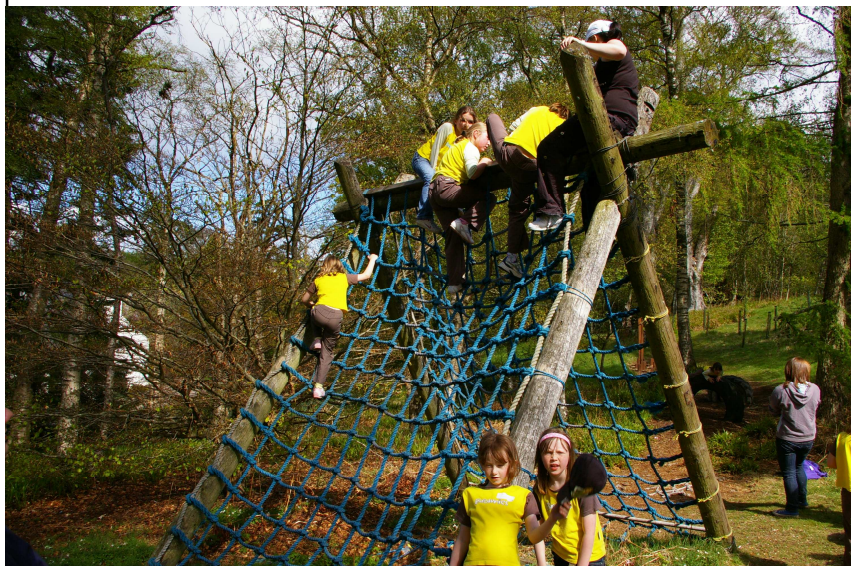
Tackling the assault course at Templars