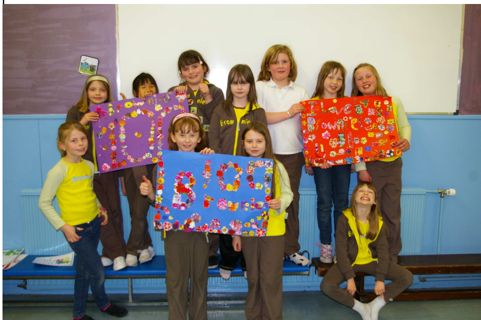
Brownies making a collage of 100 flowers for the centenary.